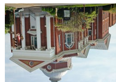
Manly Memorial Baptist Church

202 South Main Street Lexington, VA 24450 www.manlybaptist.com (540) 463-4181