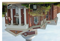
Manly Memorial Baptist Church

Since cleaning supplies are so hard to find these days, we are asking for Lysol or Clorox wipe donations. The next time you are at a store and see these, please pick up one and drop it off at the church. Thank You